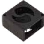
AK2512 Micro Blower