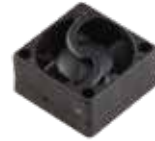
AK1708 Micro Fan