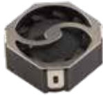
AK1305 Micro Fan