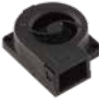
AK2008 Micro Blower