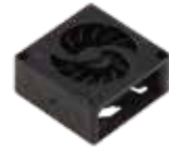
AK2008 Micro Blower