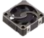
AK1504 Micro Fan